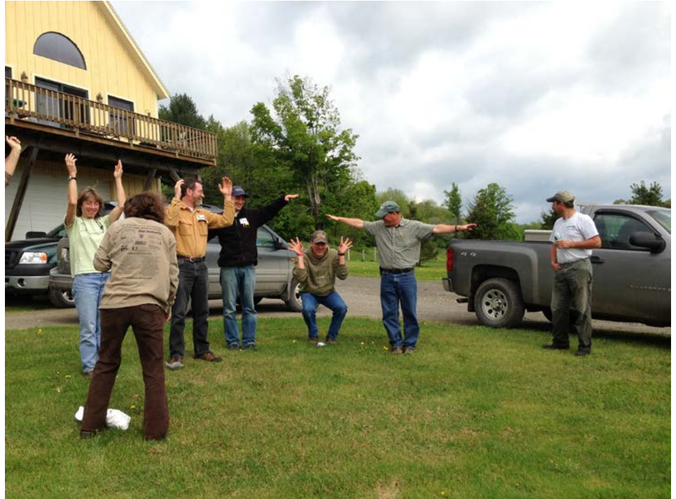
Coming back soon! Tree Farm Inspector Field Day!

However, what we cannot provide is what you all already have inside of you. A stewardship mindset is what I believe to be most important as a forester. From these conversations over the past few months, it is clear to me that this mindset comes from a love of the forests and a passion for the natural resources of Vermont. This passion is reflected in what you are committed to and involved in outside of Tree Farm and your regular work day. A question I asked all of you was, "On what committees or boards are you serving?" Here is a list of all of those mentioned to me: VWA Board, Tree Farm Committee, Forest Stewards Guild, NESAF- assorted committees, Town Conservation Commissions, Selectboards, Tree Warden, Regional Planning Commissions, VT Coverts,