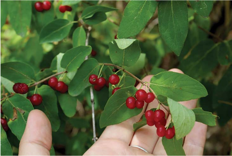
Fruit and leaves of an invasive honeysuckle.

Flower color ranges by species, Morrow's has white to yellow flowers, Tatarian has pink, red or yellow flowers, and Amur has purple, white or yellow flowers. The flowers turn to twinned fruits in the fall that are orange to red.