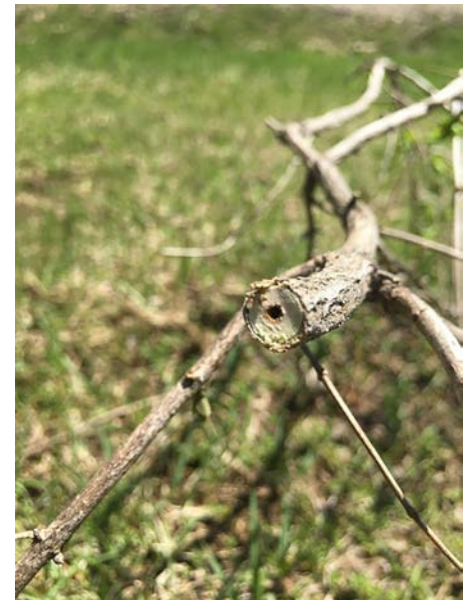
Hollow/brown pith of invasive honeysuckles.

http://www.dcnr.state.pa.us/cs/groups/public/documents/document/dcnr_010229.pdf