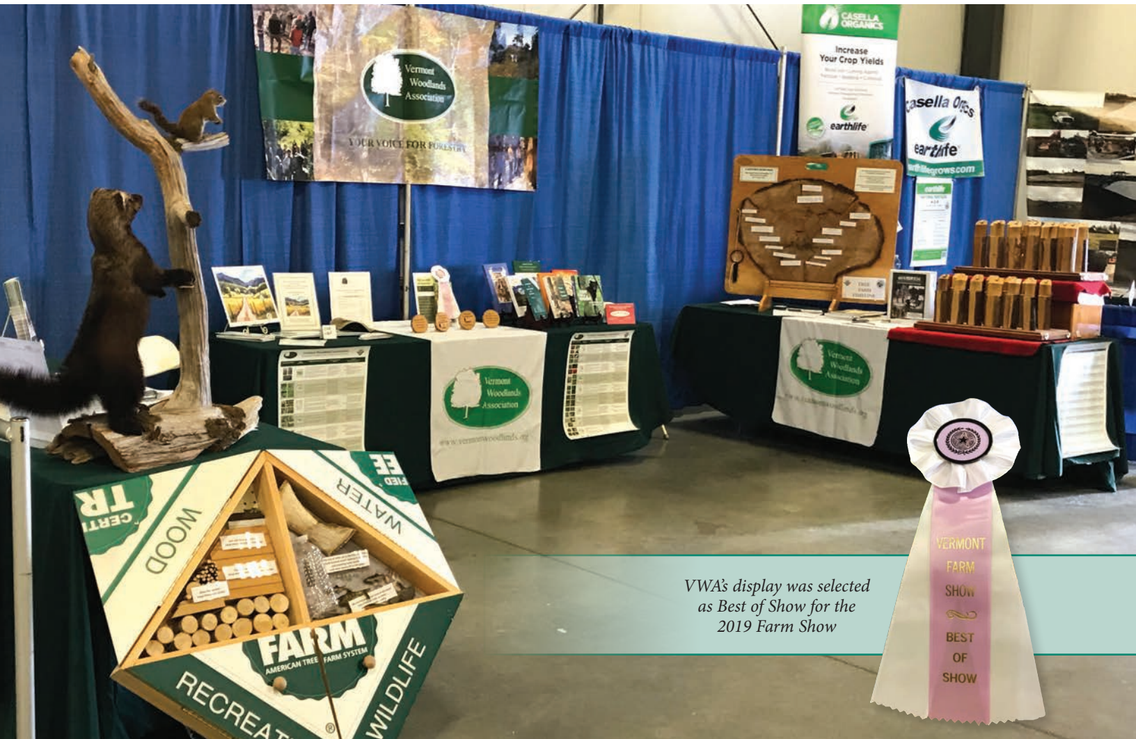
VWA's display was selected as Best of Show for the 2019 Farm Show

NON-PROFIT ORG. U.S. POSTAGE PAID RUTLAND, VT 05702 PERMIT NO.144