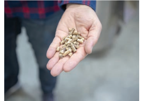
Pellet boilers produce significantly less air pollution while generating heat more efficiently than their traditional counterparts.

of $1.4 billion and supports 10,500 jobs in forestry, logging, processing, specialty woodworking, construction and wood heating. The new Vermont Forest Industry Network creates the space for industry professionals from across the entire supply chain and trade association partners throughout the state to build stronger relationships and collaboration throughout the industry, including helping to promote new and existing markets for Vermont wood products, from high quality furniture to construction material to thermal biomass products such as chips and pellets. For more information please visit www.vsjf.org .