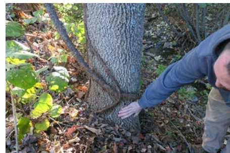
The injection port plug installed for injecting the chemical.

Before we get into the decision process we need to be clear on some related issues. First, we are not advocating some major effort to save even a small percentage of the ash in Vermont. The cost would be ridiculously high, the effort would not be practical, and the amount of chemicals would be catastrophic to the environment. This is a very small strategic effort using a lot of science. Second, none of this would have been necessary had our country invested in stringent importation controls and given APHIS the tools needed to stop the problems from entering the country. You need to know that politics have been a major influence on the phytosanitary standards enacted by the government and APHIS has been hamstrung at several levels in their attempts to control the import of wood products and plant material. It is still a problem despite the clear destruction invasives have wrought in the US. Finally, we are talking about using chemicals and we have mentioned that some of the salvation techniques involve GMO's. These are controversial things to say in Vermont. The efforts we are discussing do try to minimize both the use and methods of chemical application, and the GMO's TACF has developed for the American chestnut still have to undergo some incredibly