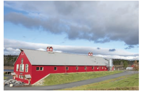
Vermont Artisan Coffee & Tea's 15,000 square-foot facility in Waterbury Center is heated with a wood pellet boiler system installed by SunWood Biomass.

Vermont’s forests are one of its most abundant natural resources and, as long as trees are growing back at the same rate that they are cut down, wood is considered a renewable resource.