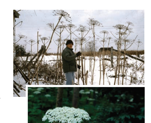
Photo Credit: R. Westbrooks, Giant Hogweed stalks in winter, CC BY 3.0 US W. Ciesla, the flat-topped blooms of American Cow-parsnip, CC BY-NC 3.0 US

Check out this site if you'd like to learn more about the native plant, American