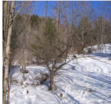
Released apple tree