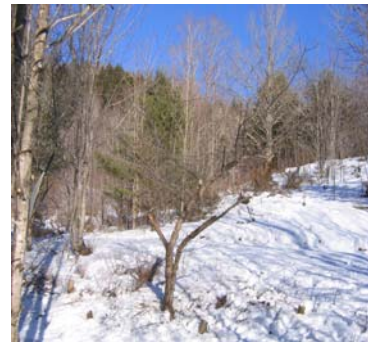
Released and pruned apple tree

After you have successfully released your trees, it is time to begin pruning (remember, this may occur in stages of 1-3 years after releasing). Pruning involves the removal of certain live branches or portions of branches to enhance health, form and fruit production. If there is more than one living stem select the largest, straightest, healthiest stem and remove all others. If the tree is very tall and spindly as a result of “reaching” for sunlight, the removal of competition can result in the tree breaking off or bending over with the first winter snows. With such trees, I recommend shortening them by cutting off the top above a healthy live branch to bring the overall height down to where breaking or bending is less likely. A certain common sense judgment is required here! For trees that have been in the shade of competitors for many years, this is all that I suggest doing the first year or two. Let them adjust gradually to the change.