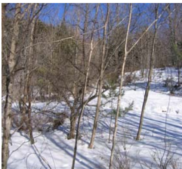
Over-topped apple tree